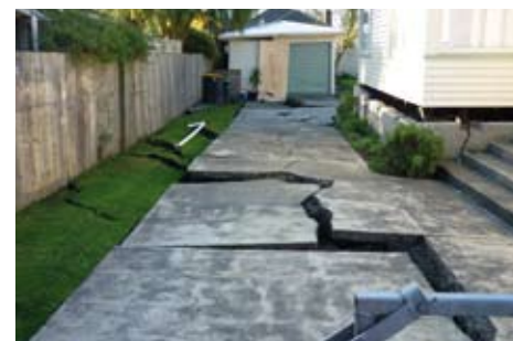
Photo: One of the affected houses the team inspected in Christchurch.

The Canterbury earthquake has been a wake-up call to us all and a timely reminder to be prepared. Start making plans now so that you can be self sufficient in your home for at least 3 days. Check the inside cover of 'The Yellow Pages' to find out what you need to prepare to get thru.