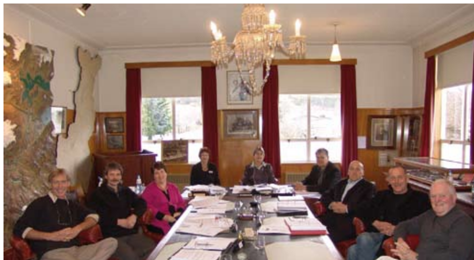
Photo: The Vincent Community Board meeting held at the Vincent County Council chambers

Some parallels can be drawn with the same challenges faced by this amalgamated ward".