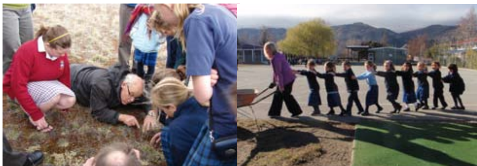
Photos: Ruud Kleinpaste 'The Bugman' has captivated audience - This photo was supplied by Department of Conservation. Cromwell Primary School making learning fun.

Some of the projects to date include making worm farms, creating edible gardens, germinating native seeds that will be then planted around the school and reusing sandwich wrappers.