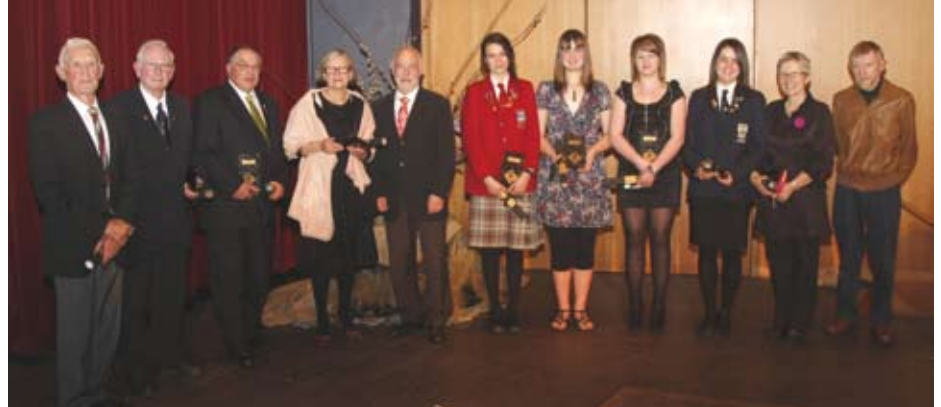
Photo: This year's Awards Winners