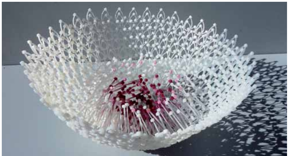
Photo: 'Central Bloom' kindly supplied by Central Otago District Arts Trust

The arts are very much a catalyst to Central Otago's economic development, showcasing the regions' artistic strength both nationally and internationally is an objective of the Central Otago District Arts Trust, and this new event really achieves this.