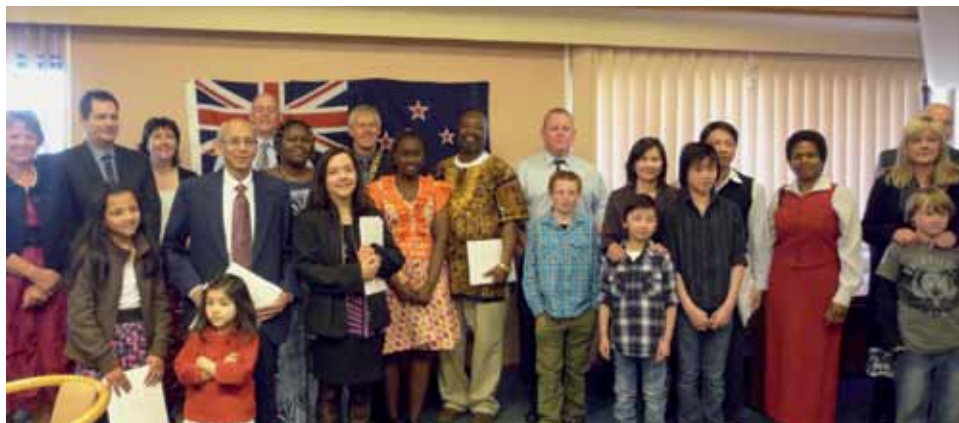
Photo: The Families welcomed as New Zealand citizens

Central Otago as a community is the richer for having these families share their skills and talents with us - we welcome you all.