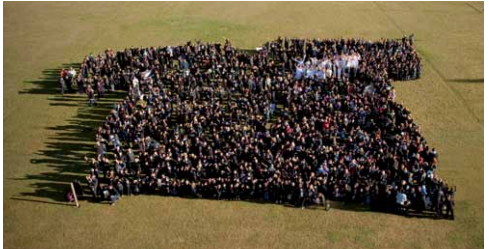
Photo: Our welcome to the All Blacks

Special thanks must go to the Cromwell Rugby Club and the principals of the Cromwell schools whose efforts ensured everyone had a memorable morning. To quote an overheard conversation "this is fantastic – it reminds me of when I was young and the Governor General visited" and, "my goodness this has stopped the town".