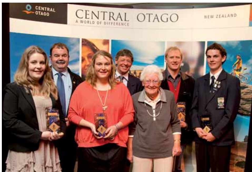
Photo: This year's Central Otago Award Winners

To read more about the award winners and the evening's celebration go to www.aworldofdifference.co.nz