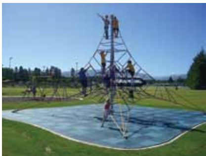
The new climbing frame proves to be popular.

A new fun piece of playground equipment now takes pride of place at the Molyneux Park Playground. Thanks to the funds raised through New Zealand Community Trust (NZCT), a large climbing net was able to be purchased for the playground.