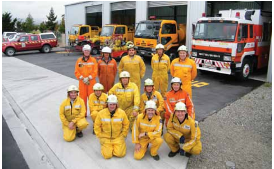
Fire crew outside the new fire depot in Alexandra.

Better still, both the Alexandra and Tarras volunteers now have an office and the “luxury” of an ablution block when they get back to HQ after they’ve been called out to protect our district.