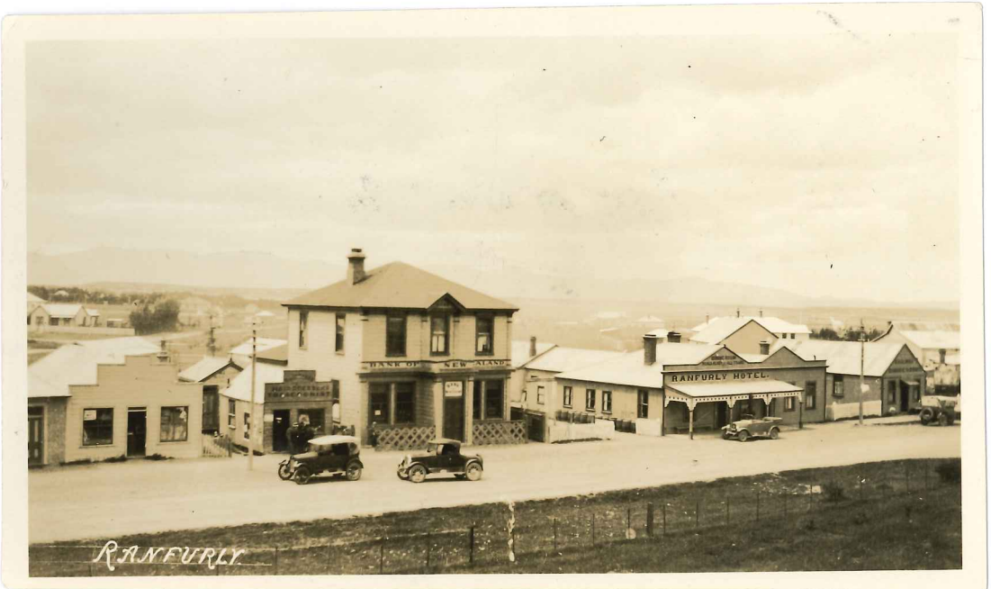
Bank of New Zealand, Ranfurly. One of only two stoned building in the town. (n.d.)

Hand written on reverse, " The other half of the main street across the railway yard from the bank. The house I have my eye on marked X." (n.d.)