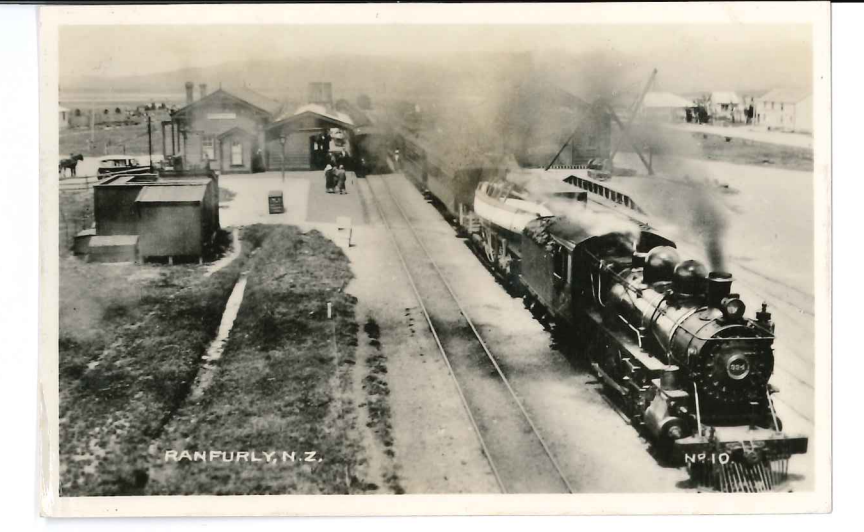
Ranfurly, NZ., No. 10. (n.d.)