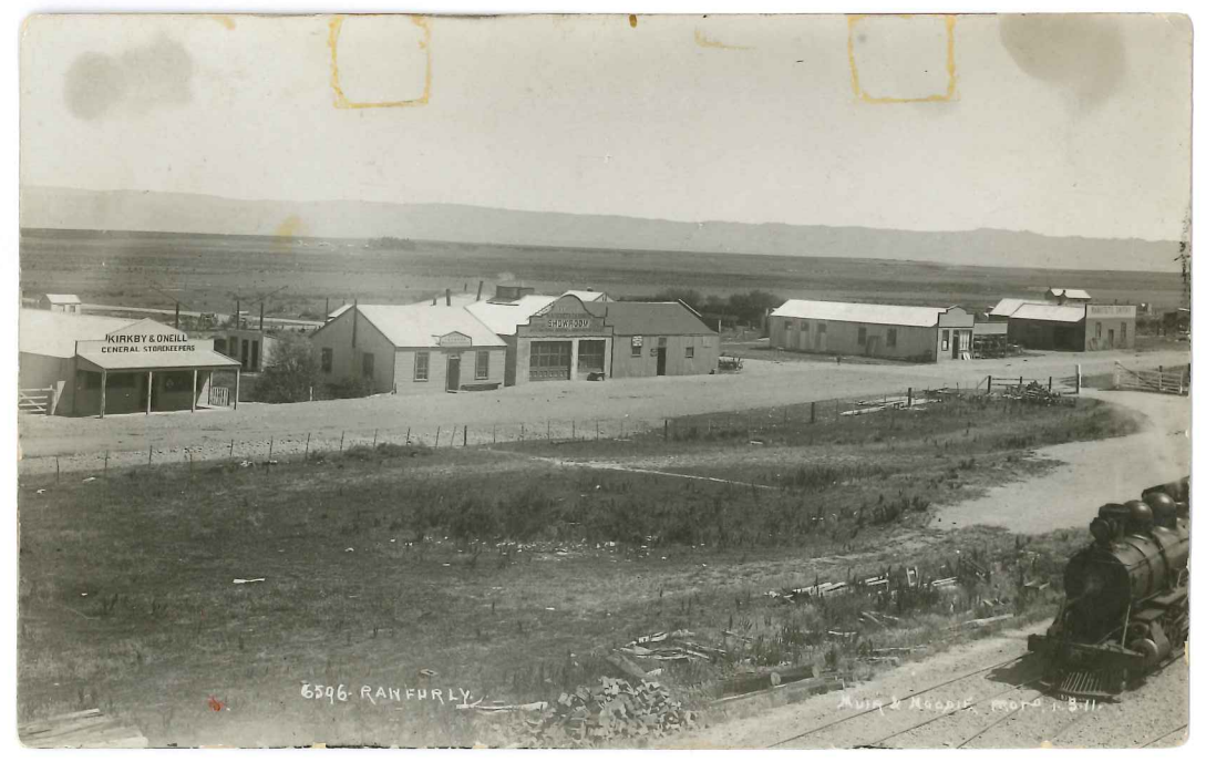
6596 Ranfurly.