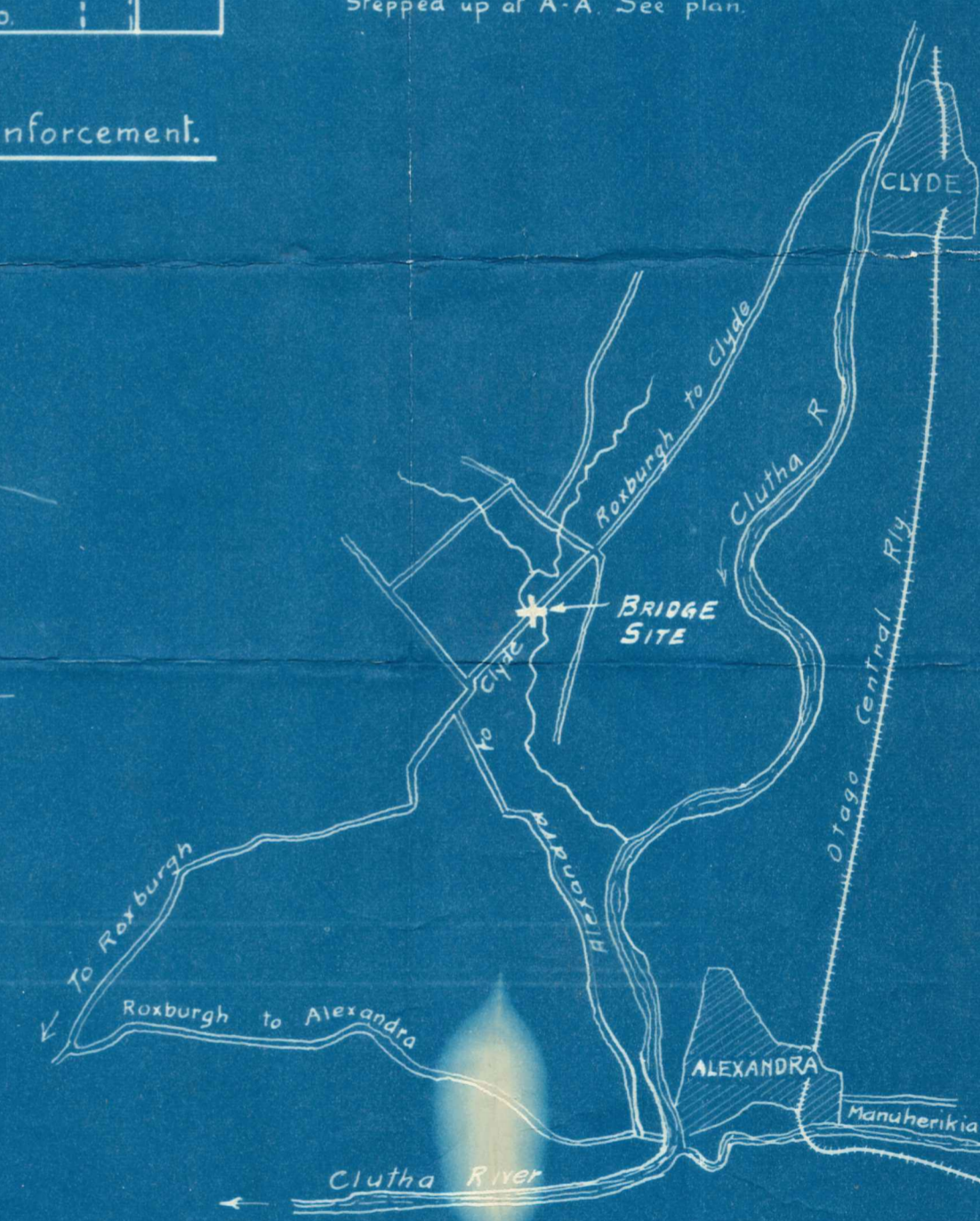
LOCALITY PLAN Scale 1/4 in. to 1 in.

EXISTING STRUCTURES SHOWN THUS NEW WORK SHOWN THUS OR THUS