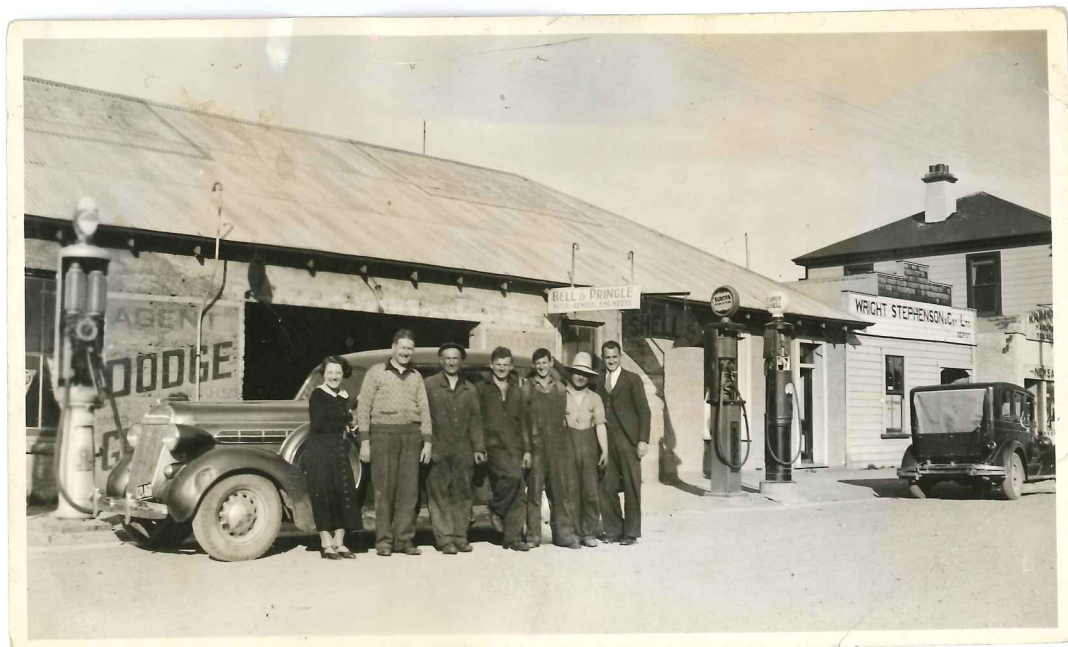
Bell & Pringle Motor General Engineers. (n.d.)