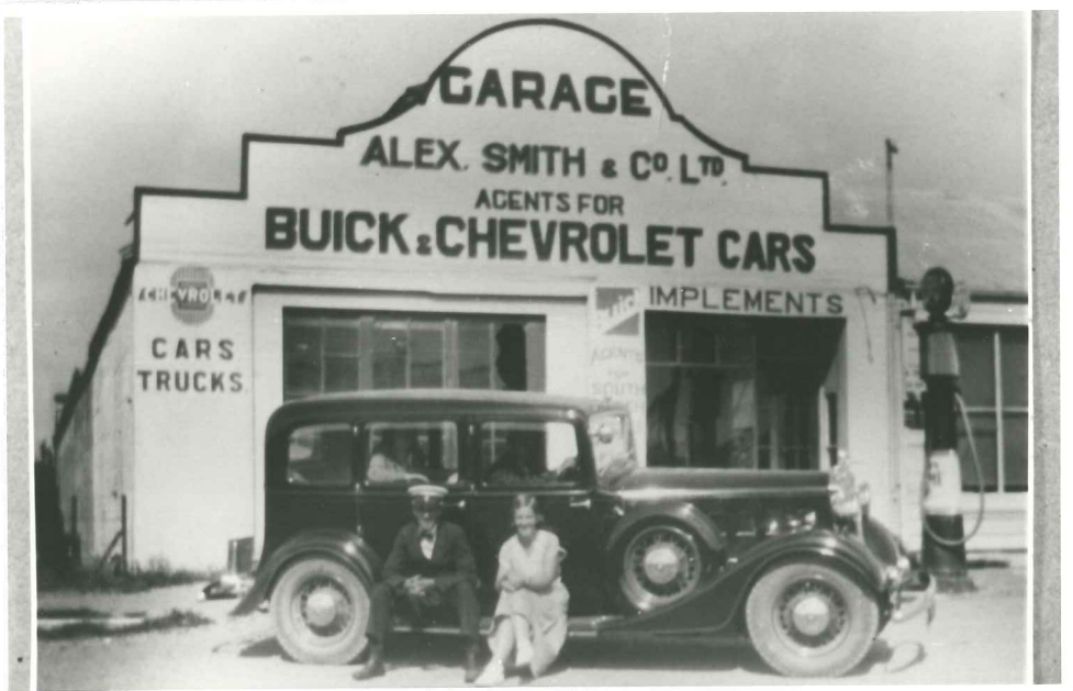
Handwritten on the back of this post card is the date 1898.