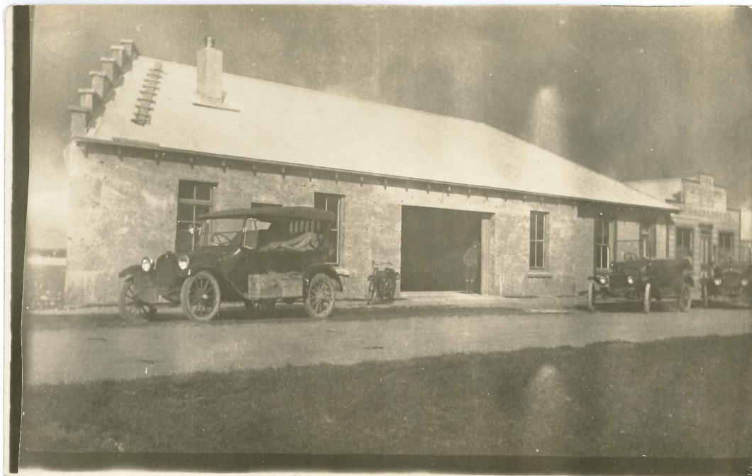
Pringles garage, side view and front view. (n.d)