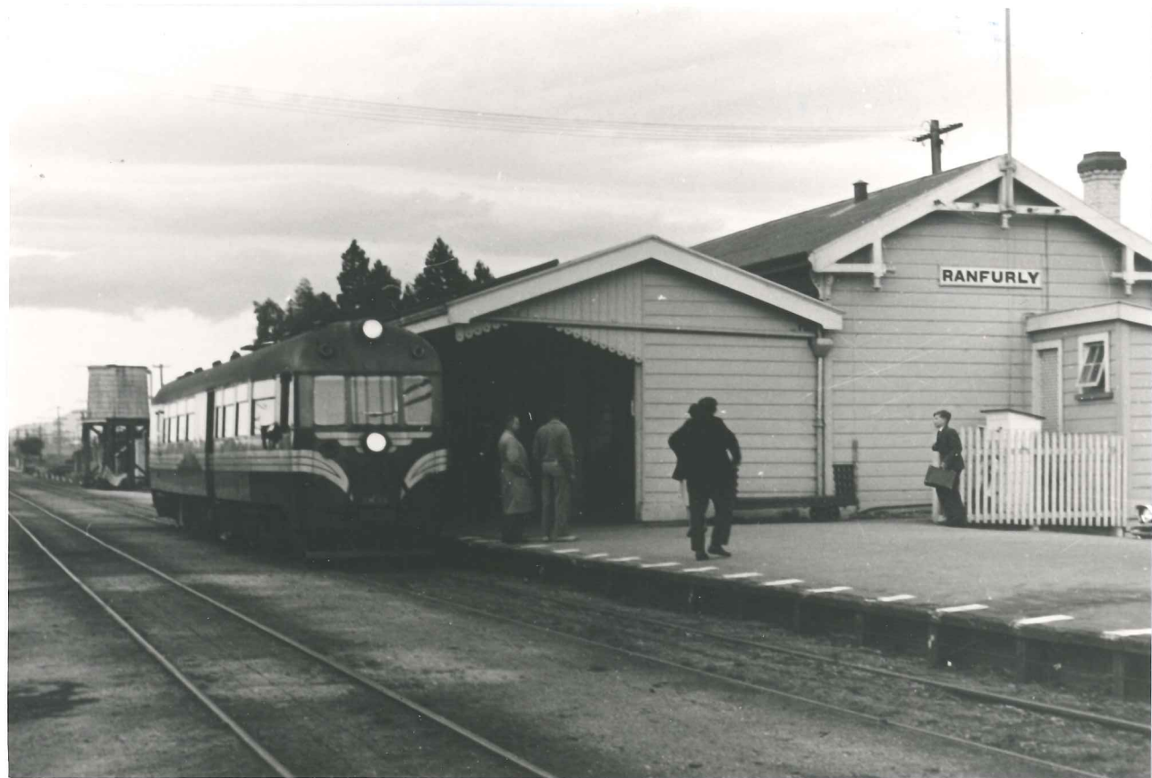
Ranfurly railway station. (n.d.)