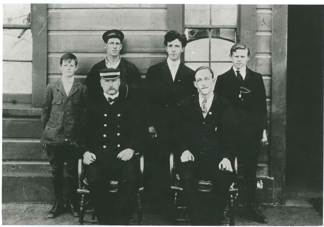
Railway staff, Ranfurly. (n.d.)

Images associated with the the railway, Maniototo. Sources and dates unknown.