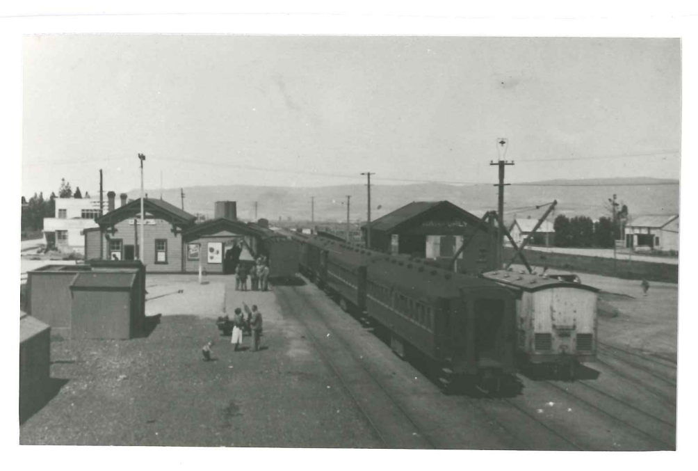
Photograph 33: A mid-1950's shot looking south. The Centennial Tea rooms are visible on left- probably capturing most of the midday meal business at this time.