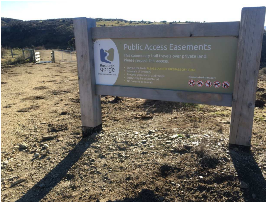
Figure 1: Entry & wayfinding signage, Roxburgh Gorge Trail

The above signs are typical of the size and style of signage expected for the Lake Dunstan Trail. These signs advise the public of general expectations of trail behaviour and various exclusions that may apply. The signs will be developed in consultation with the land manager(s). The Trail Developer does not hold management rights to the land where the trail is located thus any restrictions placed on use of the trail will be at the landowner's discretion.