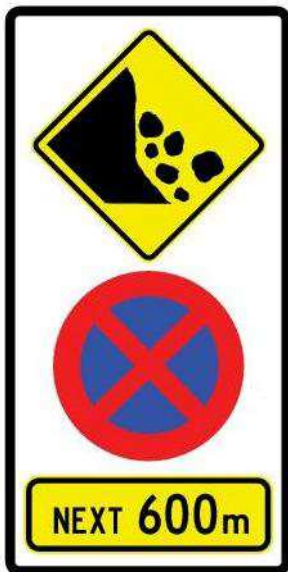
Figure 3: Rock fall hazard, No stopping 600m

The above signs are installed on the Roxburgh Gorge Trail near The Narrows, 5km south of Alexandra. These signs advise of the potential for rock fall and that no stopping is recommended to minimise exposure to the hazard.