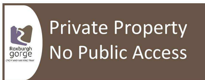
Figure 5: Private Property

The above figure details all the warning signs used on the Roxburgh Gorge trail to provide an example of the type and nature of warning signage. It is likely that some of the above signs will be required for the Lake Dunstan Trail. These will be identified during the construction process and installed prior to the trail being opened to the public.