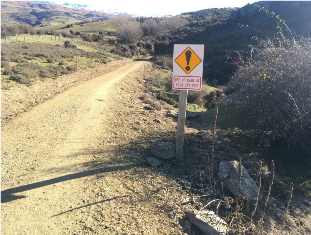
Figure 2: Warning Advisory sign, Roxburgh Gorge Trail

This sign warns users that they accept use of the trail at their own risk. These signs are installed at the very beginning and end of the trail such that trail users can make a decision and have the ability to turn around before getting a significant distance along the trail route.