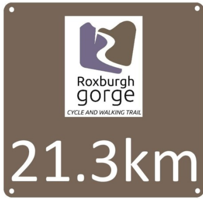
Figure 6: Distance markers

The above 200mm x 200mm signs will be installed on timber posts at 1km intervals along the trail to advise users of the distance travelled and distance to go.