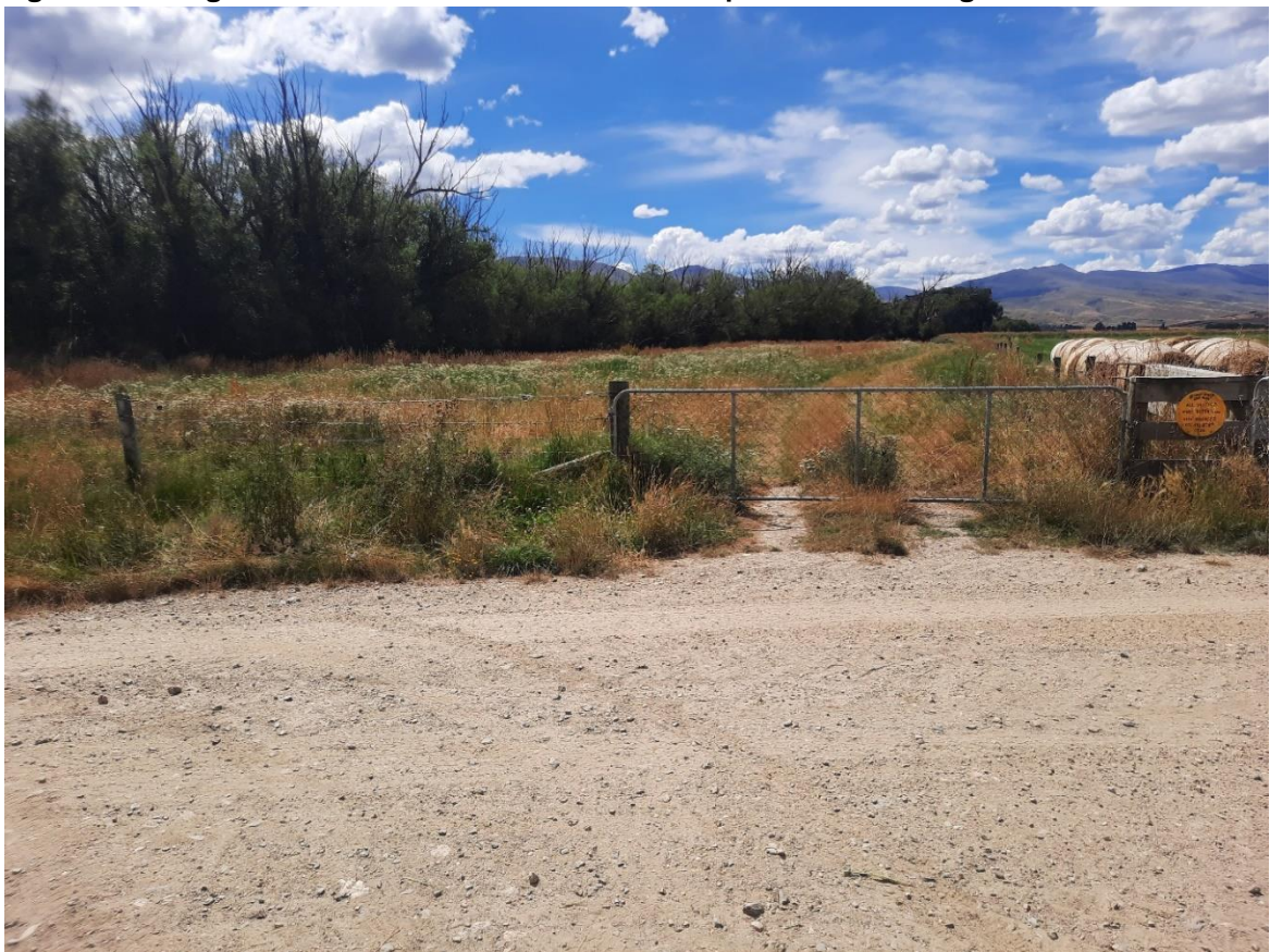
Figure 6: Existing entrance for Lots 2 and 4 on Mawhinney Road (photo taken looking north).