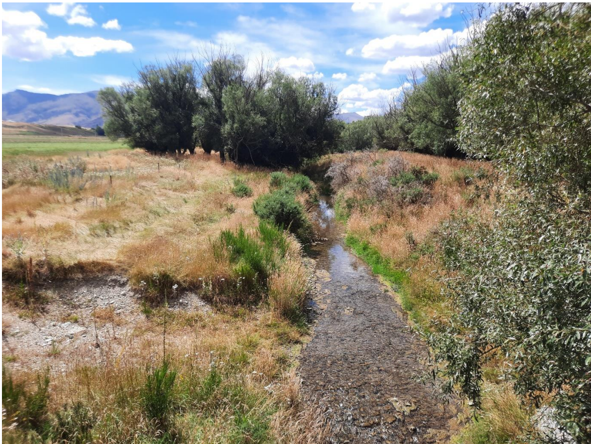
Figure 7: Thomsons Creek viewed from Mawhinney Road (photo taken looking north).

There are no reserves or public conservation land, heritage sites, notable trees, or named water bodies (other than Thomsons Creek) located within or adjacent to subject site.