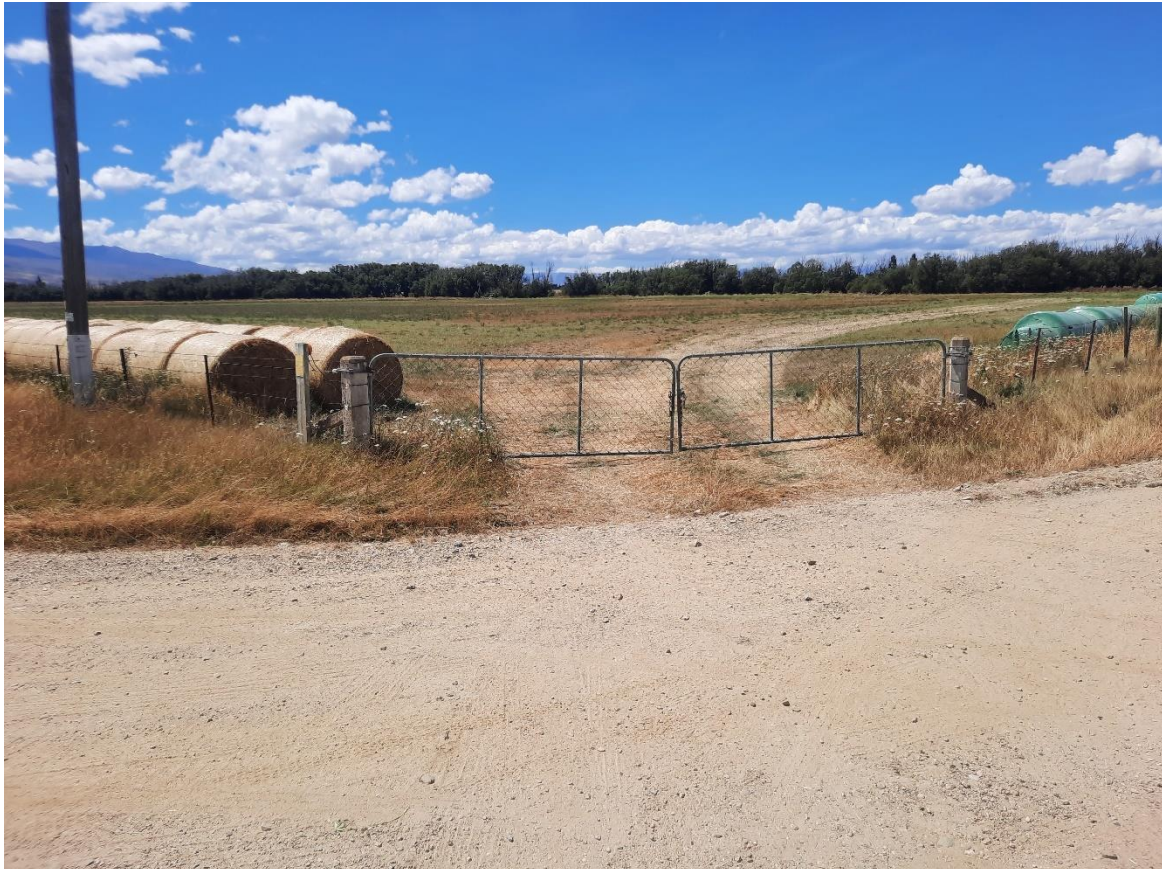
Figure 4: Existing entrance for Lot 1 on the corner of Racecourse Road and Mawhinney Road (photo taken looking northeast).

Lot 1 and Lot 2 have existing accesses to Racecourse Road. These will be upgraded (if required), to be at least 6m wide legally and 4m wide formed, with a crossfall of at least 6%, as per Rule 16.7.5 of the CODP. Lot 1 may potentially have an alternative access onto the Mawhinney Road. Lots 5-9 have existing accesses on Racecourse Road and Huddleston Road. Lots 2 and 4 will have a rural access onto Mawhinney Road.