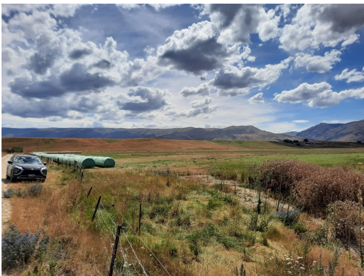
Figure 3: Area of Lots 1 and 3, taken near Thomsons Creek (photo taken looking west-northwest)

The applicant wishes to sell these two smaller properties (being Lots 1/2 and Lots 3/4) to fund new irrigation infrastructure on land owned by the applicant, including the construction of a large dam. New irrigation infrastructure is required to support productive rural activities in the area, in response to regulatory changes to water permits from the Otago Regional Council. The sale of these two smaller lots will allow for the applicant to improve their water security and be able to supply their property with irrigation water during dry periods. The vast majority of land subject to this application will remain as farmland.