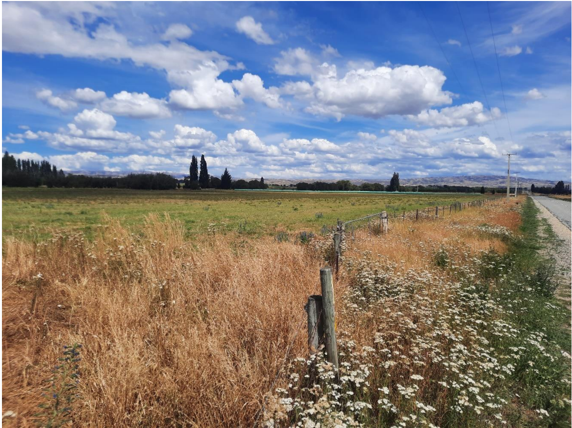
Figure 5: Existing entrance for Lot 3 on Racecourse Road (photo taken looking southeast).