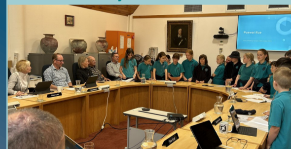
Goldfields School visited Cromwell Community Board because they're worried about dog poo.