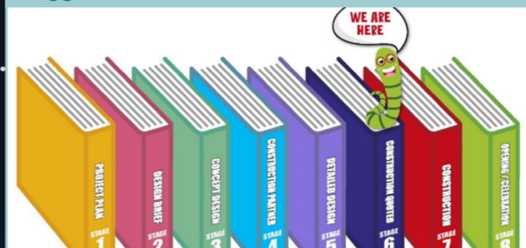
Hoping to bring an update early on in 2024 that will push this project to the next stage. Once the construction details are firm up, Alexandra Library will be moving to a temporary pop-up based at Central Stories, Alexandra while the refurbishment goes on.