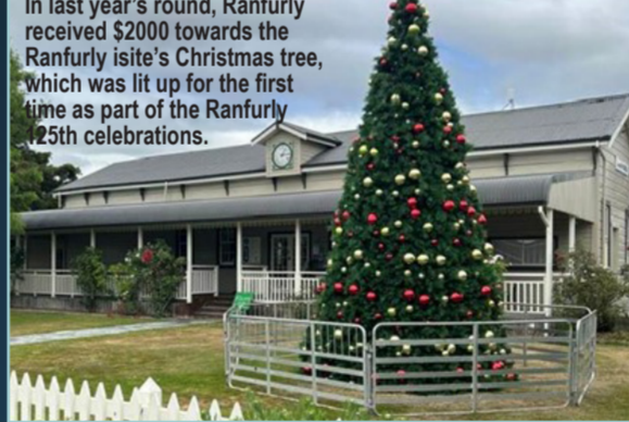
Great scenes in Ranfurly during the 125th celebrations. When Santa ran out of reindeer, an alpaca stepped in.