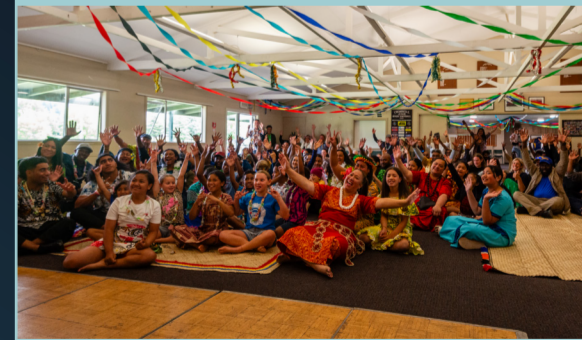
REAP and CODC's Welcoming Communities got behind this class as part of Welcoming Week.

Merry Christmas and a Happy New Year from Central Otago District Council