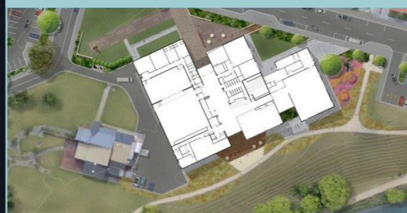
Big and bold – we've been getting sneak peeks this year of what the new hall and events centre will look like.