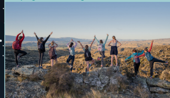
We recently launched Central Otago's wellbeing project and everyone is invited to be part of this conversation.