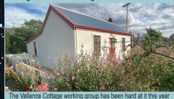
The Vallance Cottage working group has been hard at it this year future-proofing this unique pioneer cottage for the community and visitors to enjoy. People can gain access via the key pad at the front door.