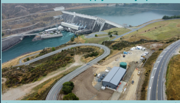
Goodbye Lime! It's been a huge year for improving the resilience of our water supplies and treatment. Read more: Infrastructure Projects.