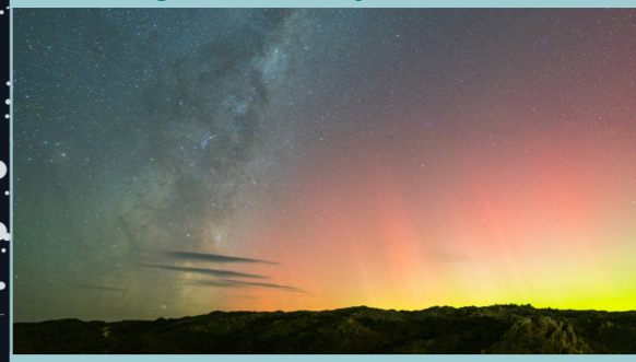
It has been a year of public consultations and plan change proposals, and one of the most exciting is a plan change that seeks to protect our special night sky from light pollution.