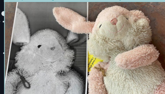
Put a bunch of soft toys in a library overnight and what did you get? Mischief and mayhem!