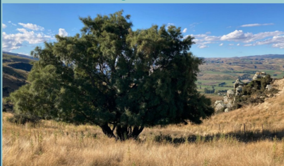
An ambitious long-term tourism vision for the district.