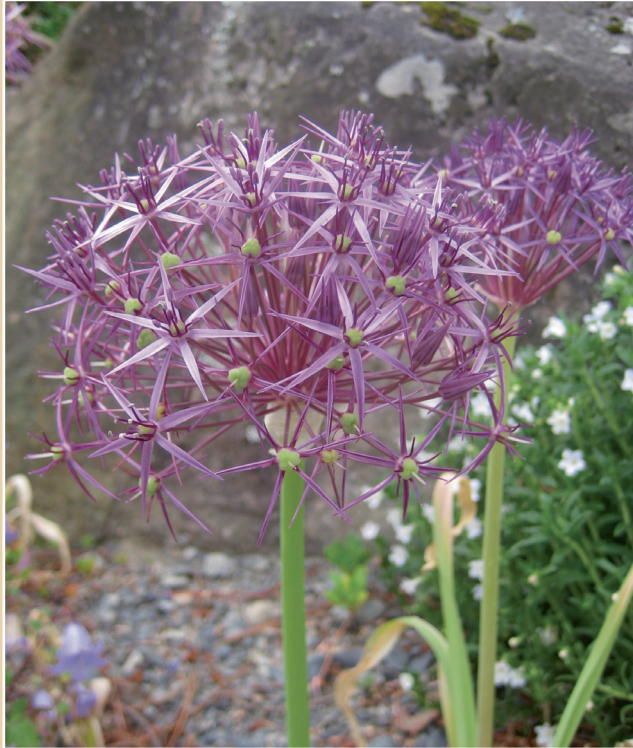
Allium 'Purple Haze'

This garden began from an initiative from Otago Polytechnic, supported by the Cromwell Community Board and the Central Otago District Council, to enhance sustainable use of water in local gardens.