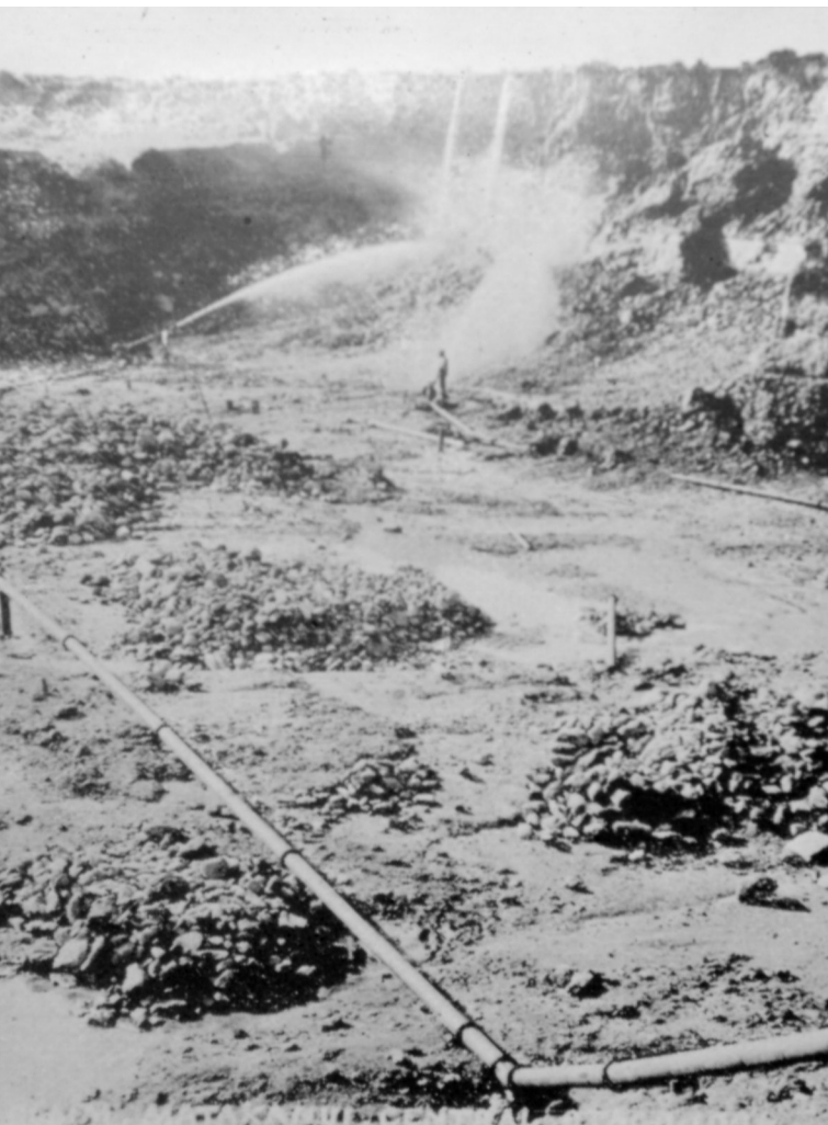
Matakanui Sluicing-Undaunted Gold Mining Company

funding grants) and is staffed by volunteers during its opening months from mid-December till the end of April.