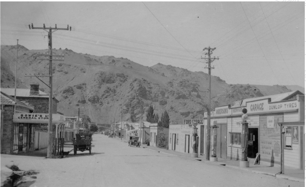
1930s Cromwell Main Street (RW Murray Collection)

The museums will collaborate to tell the distinctive stories of Central Otago and will continue to be an integral part of our community's well-being.