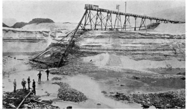
Roxburgh-Nearby Sluicing Elevator (RW Murray Slide Collection)