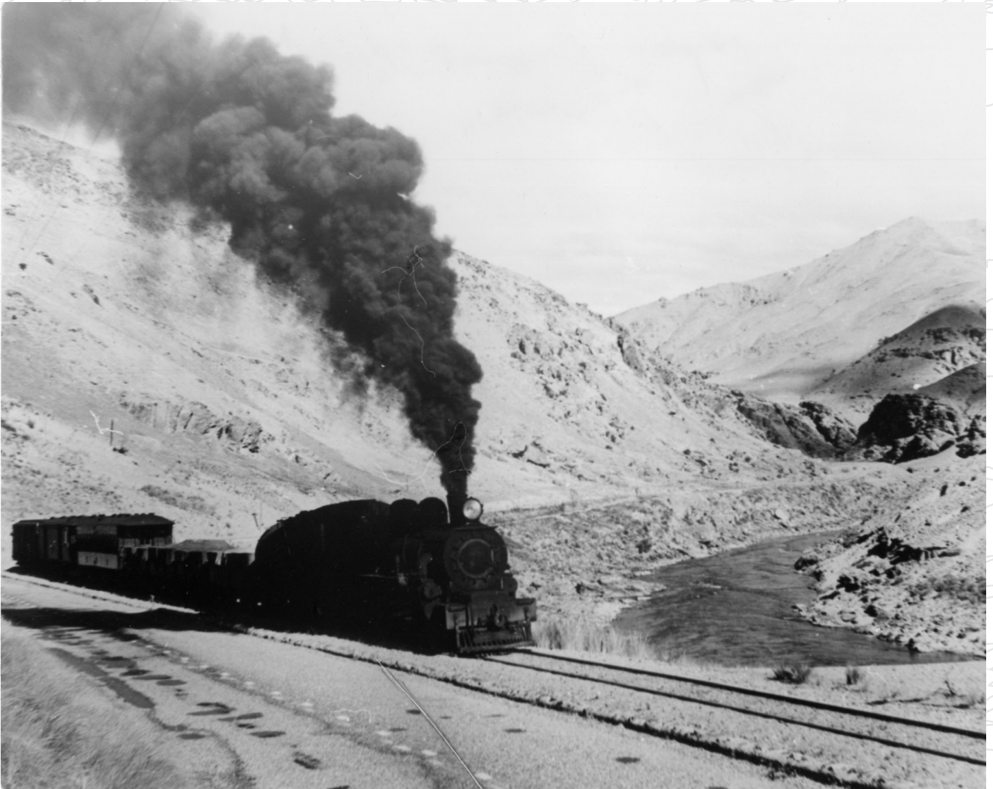
1956 Train heading towards Cromwell

This strategy shall be formally reviewed at least every five years. The sector will regularly meet and check in on progress against the agreed actions.